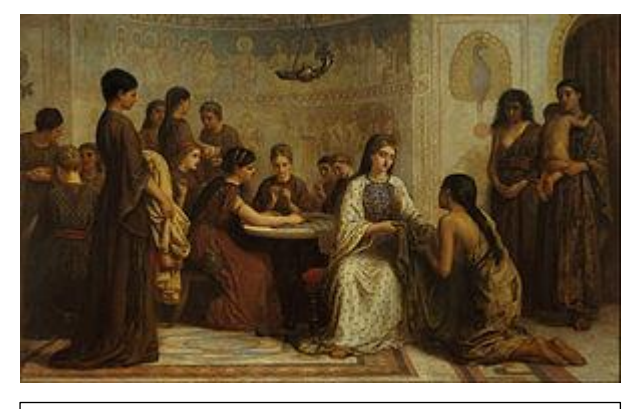
Edwin Long's A Dorcas Meeting in the 6th Century (painted 1873– 1877) imagines a Dorcas society of Late antiquity.

Dorcas Societies are named after Dorcas (also called Tabitha), a person described in the Acts of the Apostles (Chapter 9, v.36)